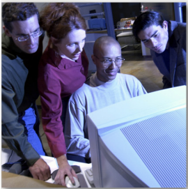
Masters Degree in Engineering Administration